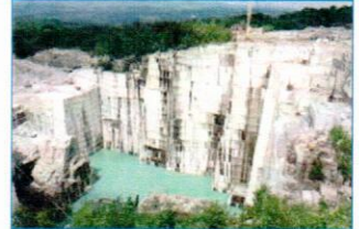
Rock of Ages Granite Quarry