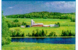
Beautiful Vermont Scenery