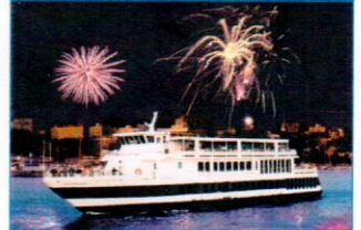
Dinner Cruise on beautiful Lake Champlain